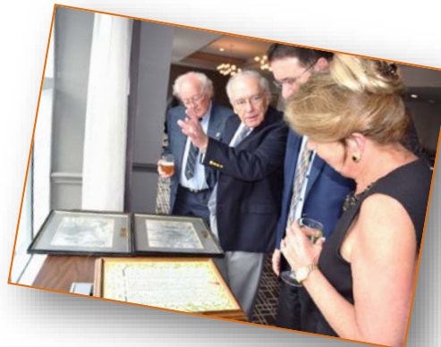
Looking at old Club photos and a list of Charter Members, AGM 2018

Join us for a visit to the Night Market on Thursday, June 21 on Carleton Street downtown. We will first meet up at Damda Restaurant, 526 Queen at 5:30 and after dinner head into the market around 7:00. For more information on the night market click here . Please RSVP by June 17 , so I can book the restaurant.