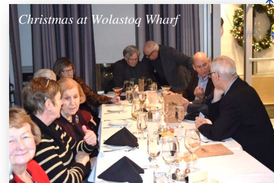
Christmas at Wolastoq Wharf